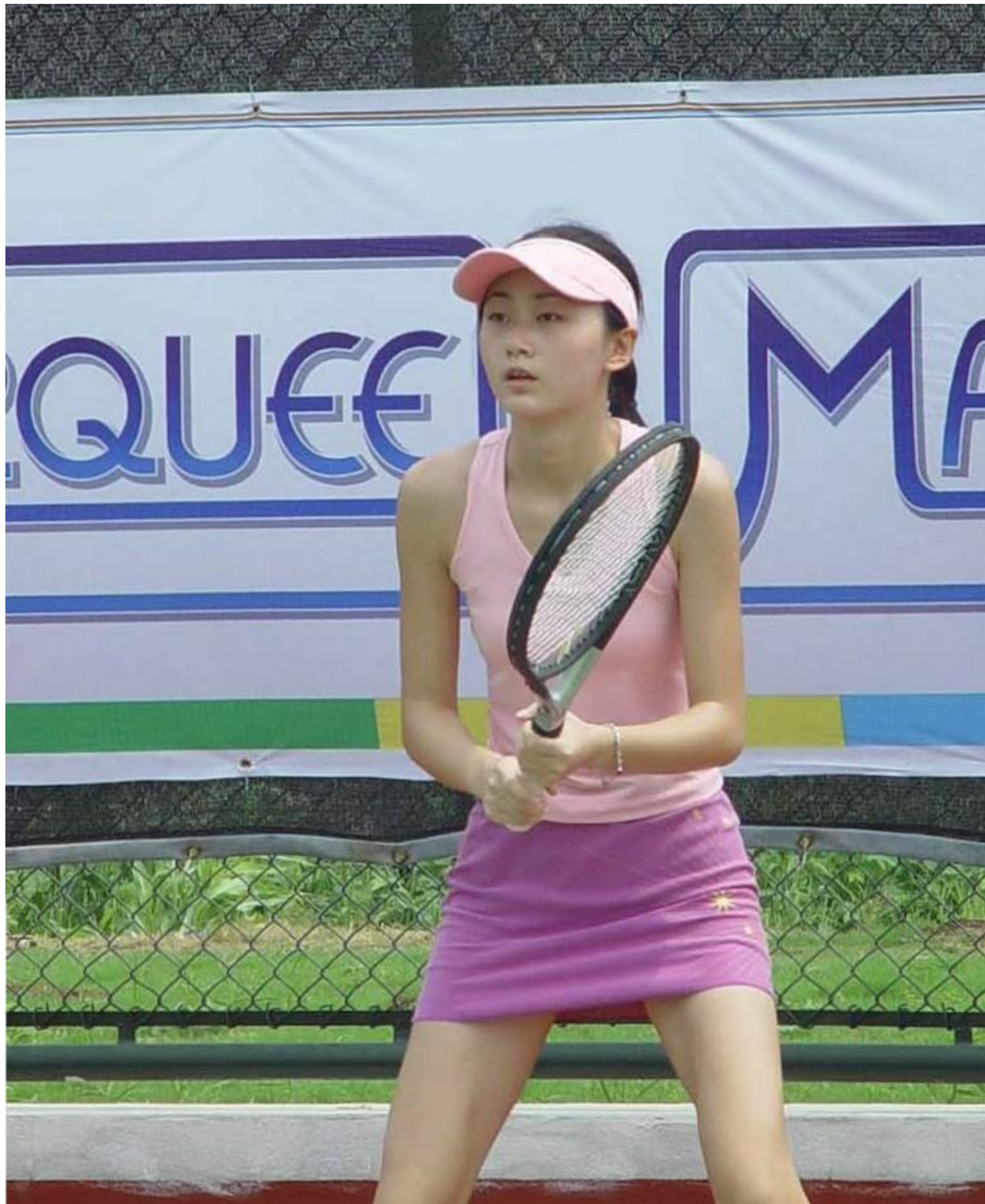
Marquee Corporation's National University Men's & Women's Tennis Championships in China