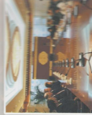
正式签署合作条约现场 The Official Signing Ceremony Marquee Corporation Delegation and Federation of University Sports of China Delegation