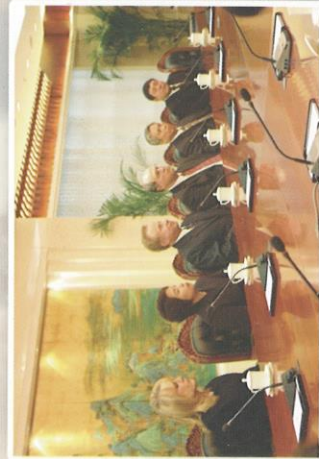
优秀的玛麒团队 Marquee Corporation Delegation