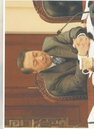
中国教育部副部长 章新胜 亲临指导 Mr. Zhang Xinsheng Deputy Minister, Ministry of Education People's Republic of China