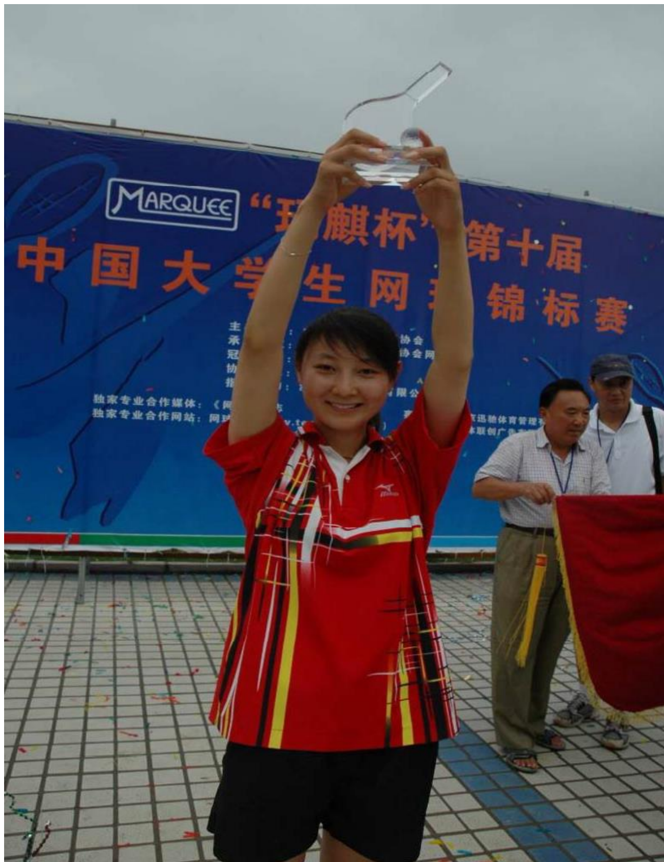
Marquee Corporation's National University Men's & Women's Tennis Championship – Awards Ceremony in China