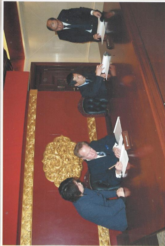
玛麒集团与中国大学生体育协会正式签约 Agreement Signing Ceremony Marquee Corporation and Federation of University Sports of China